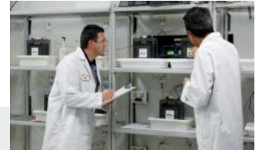
Prototype development and evaluation

To ensure the quality and superior performance of our batteries, Trojan applies the most rigorous testing procedures in the industry to test for cycle life, capacity, charger algorithms and both physical and mechanical integrity. Trojan's battery testing procedures adhere to both BCI and IEC test standards. Trojan's state-of-the-art R&D facilities include charger characterization and analytical labs, battery prototype and evaluation labs and battery autopsy centers all dedicated to providing you with a superior battery that you can rely on.