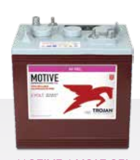
MOTIVE 6-VOLT GEL