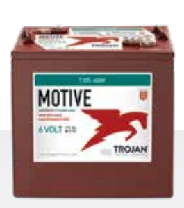
MOTIVE 6-VOLT AGM

KEY FEATURES C-Max Technolog Proprietary Paste