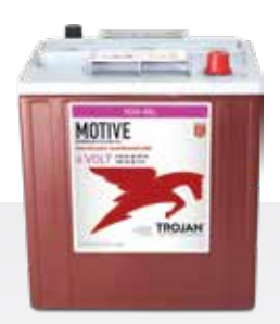
MOTIVE 6-VOLT GEL

Proprietary Gel Premium Separator Rugged Construction