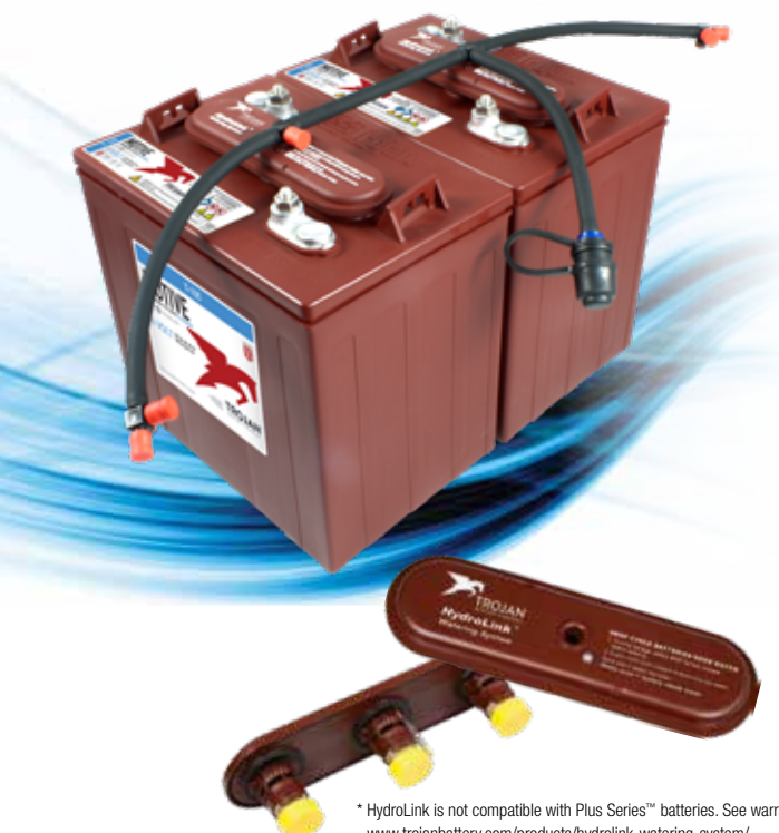
HydroLink is not compatible with Plus Series™ batteries. See warranty for details: www.trojanbatterv.com/products/hydrolink-watering-system/

Trojan's HydroLink watering system is specifically designed to work with Trojan's 6-volt, 8-volt and 12-volt flooded batteries* and takes the guess work out of properly watering flooded batteries. In addition, the design of the HydroLink watering system prevents direct access to a battery's electrolyte and reduces acid splash, enhancing safety during the battery watering process. With a simple installation of the HydroLink manifolds and tubing, a complete set of batteries can be filled in less than 30 seconds.