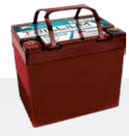
TR 25.6-25 LI-ION