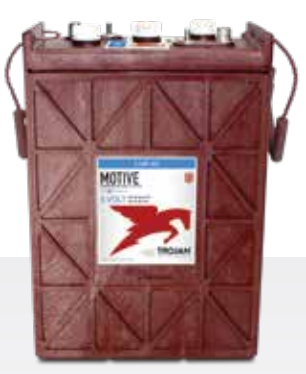
RUGGED MOTIVE 6-VOLT

Its multi-rib geometry design keeps acid channels open longer enhancing electrochemical processing while reducing the risk of stratification. Maxguard's proprietary rubber-based material formulation inhibits antimony transfer between the positive grids and negative plates; a protection not available in many other competitors' batteries. A newly fortified, thick back web provides even greater separator strength resulting in a more robust battery with increased protection against failures caused by separator degradation.